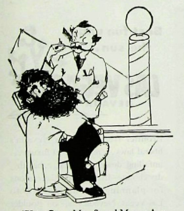
"How Can a Man Spend Money Any Better Than on His Own Face?"

When YOUR Face Hollers "HELP" LET YOUR BARBER Give You a Clasmic Pack. Man, that is some Facial! The Boncilla Beautifier Clasmic Pack that Packs the Wallop in its Vigorous, Refreshing, Skin Conditioning Action that you Feel while it is imparting that Keen, Refreshed, Well Groomed Look that makes your Face so much easier for others to look at. It Feels great too.